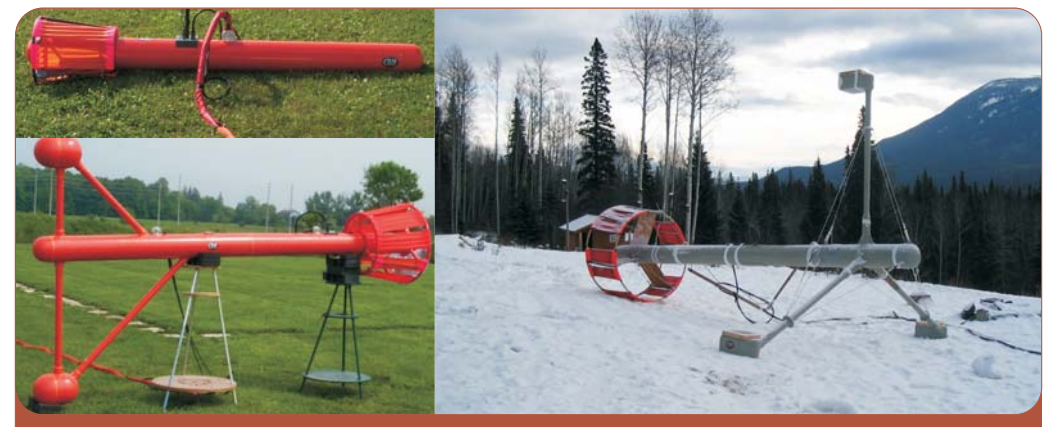
Magnetometer, Vertical / Horizontal and Tri-Axial Gradiometers offerings based on the latest GSMP-35A high resolution sensor.

All of these technologies come complete with two year warranty.