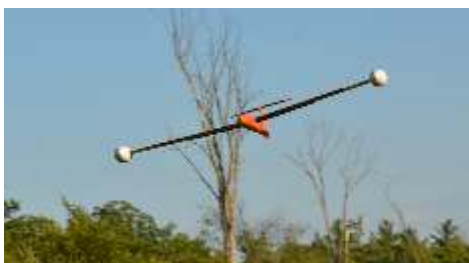
Safe, Low altitude flying