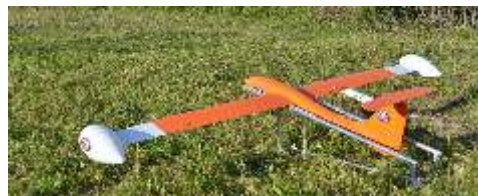
Monarch on catapult launcher

Regulations vary for different jurisdictions, therefore review local rules for operation of unmanned aircraft systems.