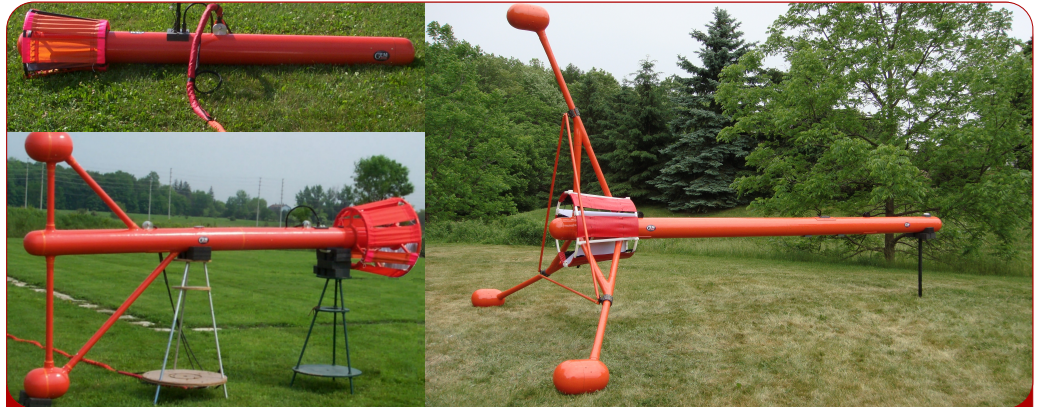
Magnetometer GSMP-35A(B), Vertical Gradiometer GSMP-35GA(B), and Tri-Axial Gradiometer GSMP-35GA3(B)

All of these technologies come complete with an industry leading two-year warranty.